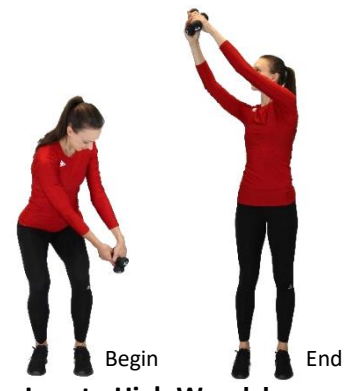
Low to High Woodchop

Stand with your feet hip-width apart. Hold hand weights by your sides. Lean forward, shifting your weight onto one leg and raise the other leg straight behind you while continuing to lean forward, creating a line with your body. Hang your arms straight down, holding onto the weights. Keep a slight bend in your standing leg. From here, bend your elbows, until your hands reach your chest. Squeeze your shoulder blades together. Slowly lower your arms straight down in front of you and return your raised leg to starting position. Repeat on the opposite side.